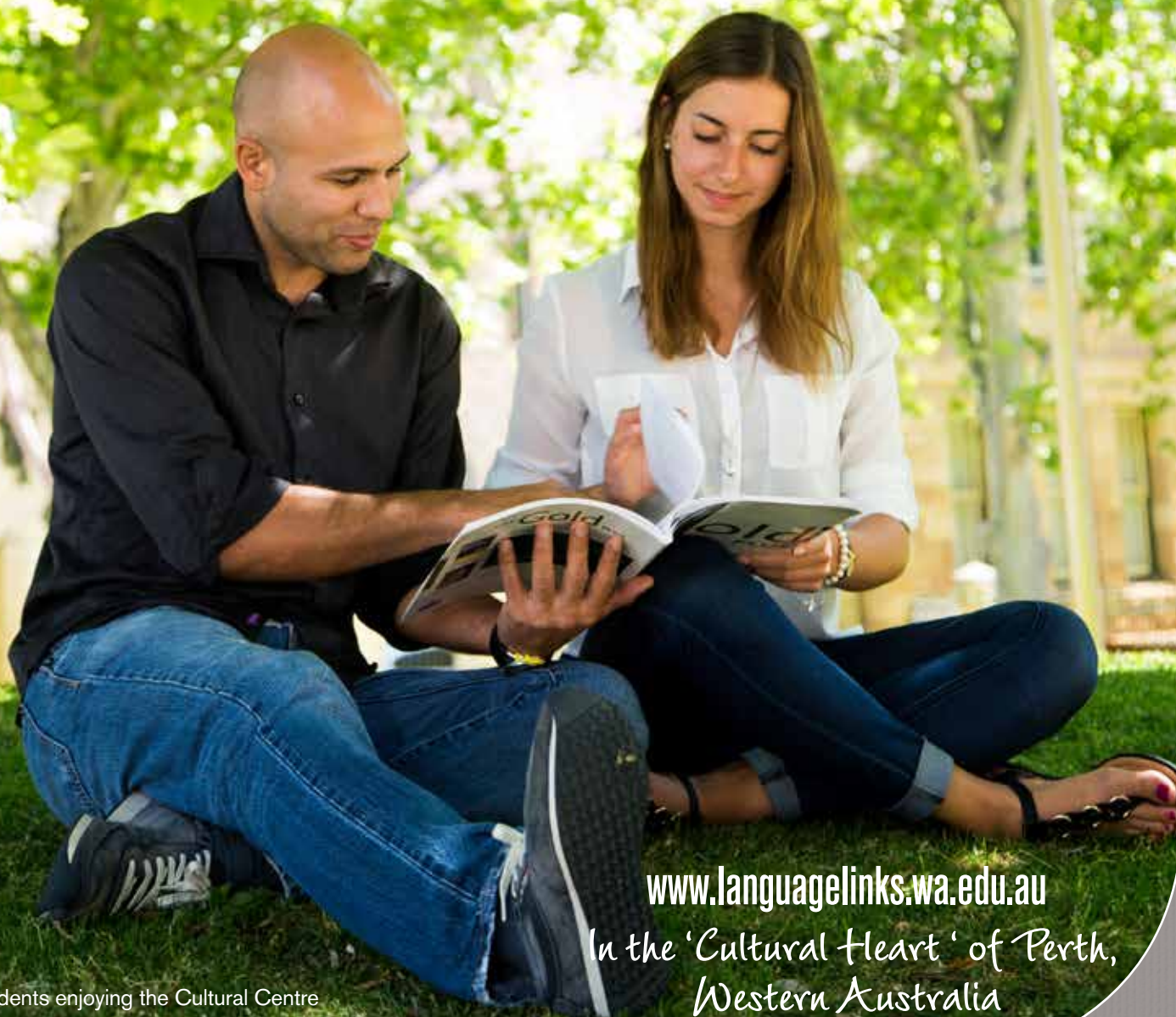
Students enjoying the Cultural Centre

Wide range of accredited English courses | Highly qualified and friendly staff | Excellent nationality mix